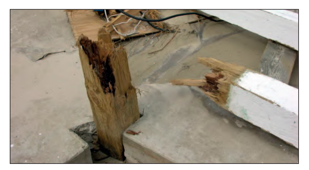
Figure 14-1. Pile that appears acceptable from the exterior but has interior decay

or resources that augment the guidance and other information in this Manual, see the Residential Coastal Construction Web site (http:// www.fema.gov/rebuild/mat/ fema55.shtm).