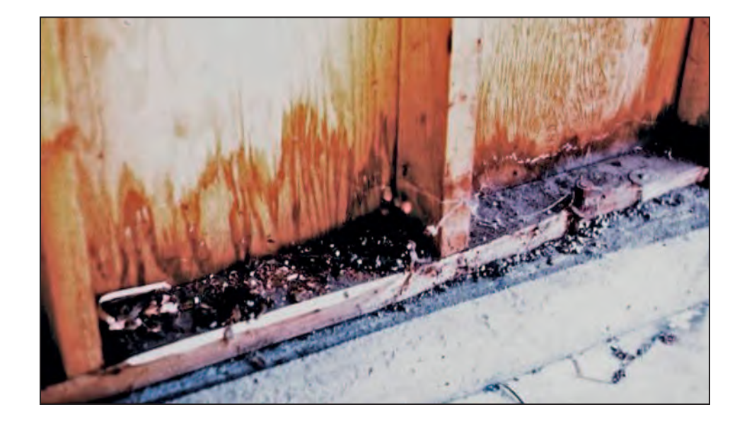
Figure 14-4. Deteriorated wood sill plate

Shearwall sill plates bearing directly on continuous footings or concrete slabs-on-grade, if used in coastal construction, are particularly susceptible to decay in moist conditions. Figure 14-4 shows a deteriorated sill plate. Even if the decay of the preservative-treated sill plate is retarded, the attached untreated plywood can easily decay and the shearwall will lose strength. Conditions that promote sill and plywood decay include an outside soil grade above the sill, stucco without a weep screed at the sill plate, and sources of excessive interior water vapor. Correcting these conditions helps maintain the strength of the shearwalls.