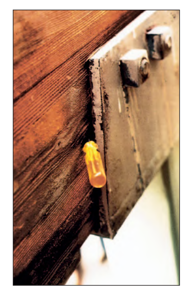
Figure 14-2. Wood decay behind a metal beam connector

Significant sources of interior moisture, such as kitchens, baths, and clothes dryers, should be vented to the outside in such a way that condensation does not occur on interior or exterior surfaces.