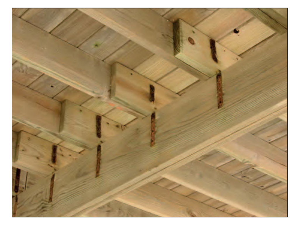
Figure 14-3. Severely corroded deck connectors

Using corrosion-prone sheet metal connectors increases maintenance requirements and potentially compromises structural integrity.